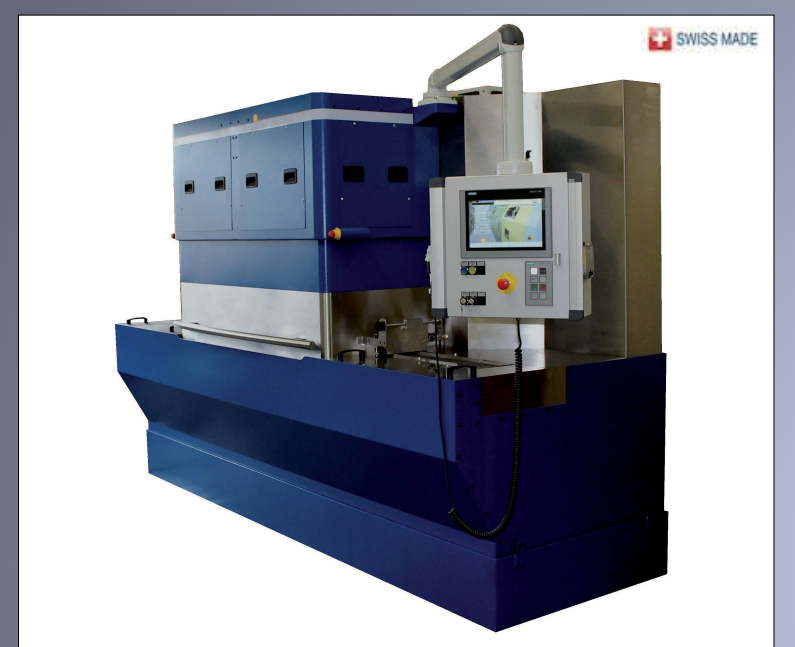
Grinding direction from right to left

Continuous through feed grinder, can be combined with up to 2 vertical stations